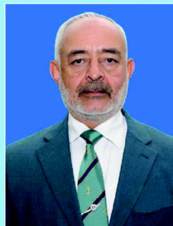
(Admiral D K Joshi)

On this auspicious occasion, I wish that the festival brings happiness to the lives of all Islanders and our Islands continue to advance on the path of peace and progress.